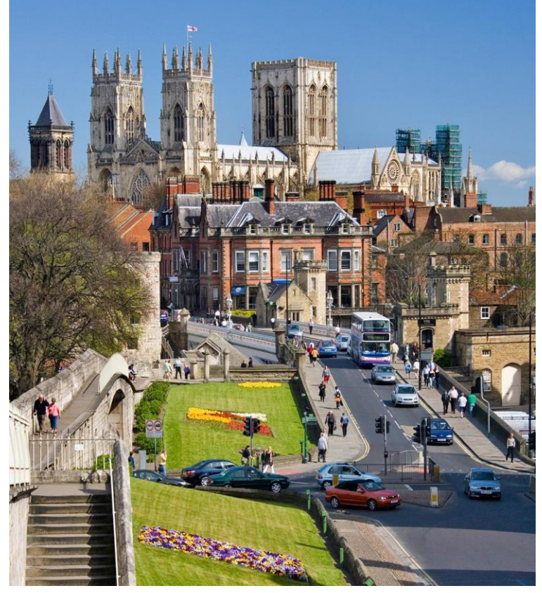
10 Days • 13 Meals: 8 Breakfasts, 1 Lunch, 4 Dinners

HIGHLIGHTS... Edinburgh Castle, Choices on Tour, York, Chester, Llangollen, Wales, Stratford-upon-Avon, Oxford, Afternoon Tea, London